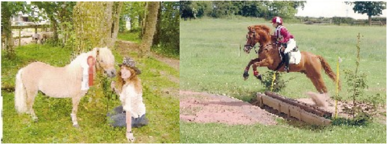
Pic 1, palomino colt foal 'Donata' Lock stock after shock! AKA Alfie

He won the Shetland breed foal rosette at Devon county show and won the mountain and moorland "small breeds" foal rosette at chard.